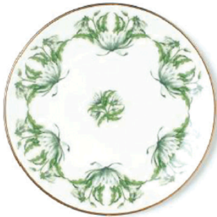
H&M Home "Leaves" porcelain plate, $9.99