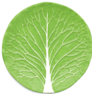
Tory Burch Lettuce Wear dinner plate, $49

But under this newly quarantined era, I have made it a point to switch sides and enjoy both the taste and presentation of my meal while eating at home. With that in mind, we've selected some of our favorite dishware to present the ideal mise en place that will surely outlast our isolation.