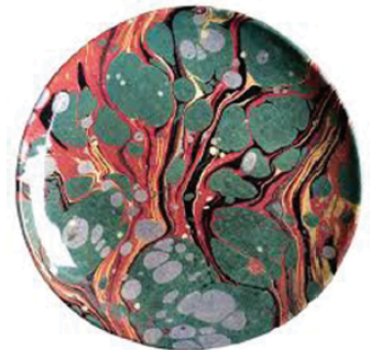
John Derian Green Yellow & Red Marble dinner plate, $164